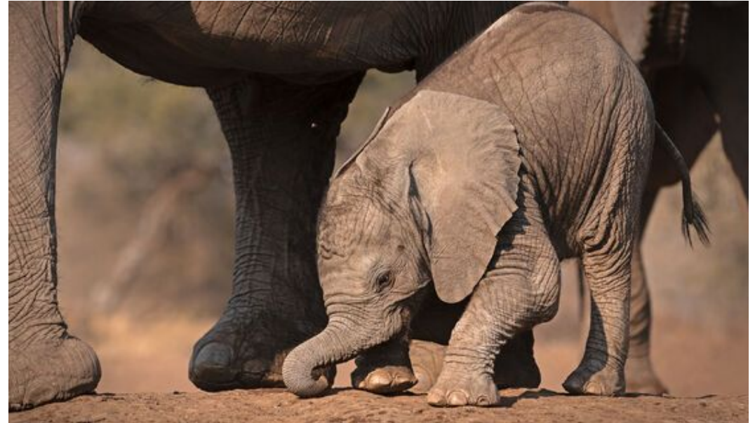
table Original Title: The Wild Sides Year: 2023 Produced by: Terra Mater Studios, Red Rock Films International Partners: Servus TV, NGCI, BBC America

There are two sides to every story – one wild tale is told from different perspectives in each episode. The dry riverbed of Mashatu, Botswana, is home to an incredible cast of creatures: A herd of elephants, a mother leopard and her cub, a jackal couple raising their young and a feisty troop of baboons. They might all look like great neighbors, but when push comes to shove, every single creature will fight for their piece of African bush. We follow their stories as they fight to stay alive and raise their young in a world full of danger.